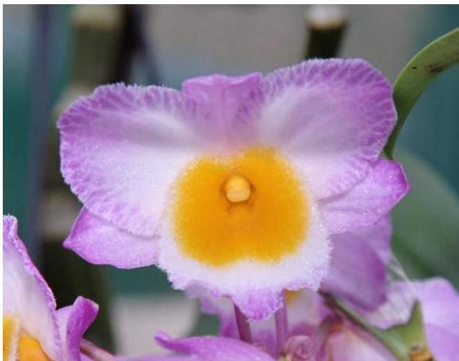
This was the Pod Parent Den farmeri