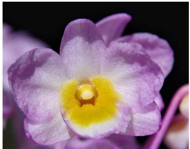
This was the Pollen Parent Den amabile.