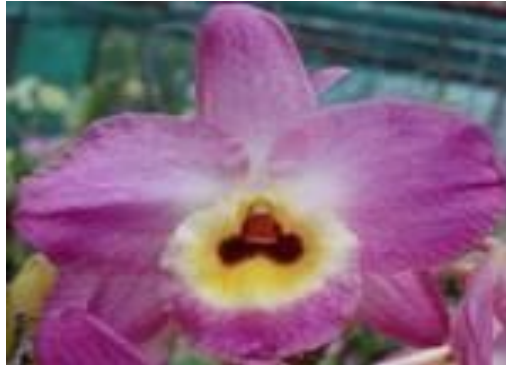
Society Emblem: Dendrobium Fivedock Fire 'Summertime'

Meetings are held on the 4 th Thursday in the months of January to November. at Concord Community Centre, 1A Gipps Street, Concord, NSW 2137 The Society was founded on 19 th July 1967.